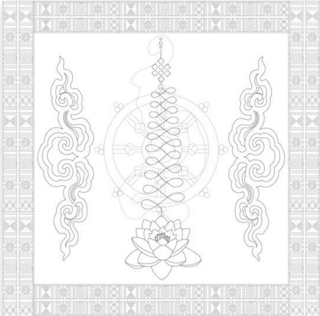
Artwork created by the researcher for Sutra Santati Textile exhibition at Delhi National Museum